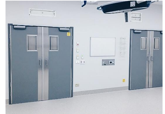
Lead Lined Gypsum wall with Lead Lined Doors.